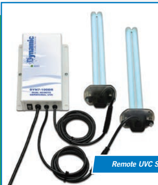
Remote UVC Systems

Dynamic Remote Mount UVC Germicidal Systems can be installed in the air handler, ductwork or fan powered filter section to provide high-output germicidal UVC light that has proven effective at inactivating molds, viruses, and other biological airborne contaminants. For exhaust air applications, UVV systems with activated Oxygen can be used to further reduce exhaust odors and extend the service life of Dynamic EDGE activated carbon panels.