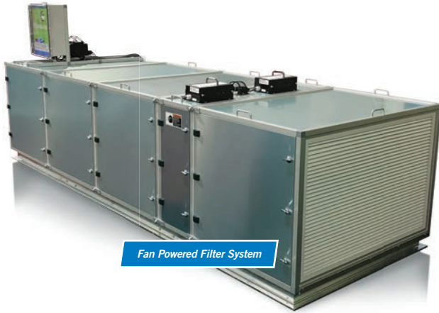
Fan Powered Filter System