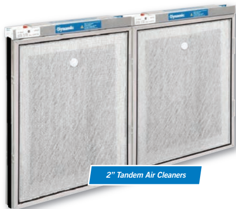
2" Tandem Air Cleaners

Designed to meet the rigorous requirements of hospitals, data centers, LEED® buildings and clean manufacturing, the Dynamic V8 Air Cleaning System couples maximum effectiveness with unparalleled energy and operational savings, providing MERV 15 performance without ionizing or Ozone generation – plus VOC reduction and superior capture of dangerous ultra-fine particles. And extended maintenance cycles means less media change outs, freeing your personnel to concentrate on more critical issues.